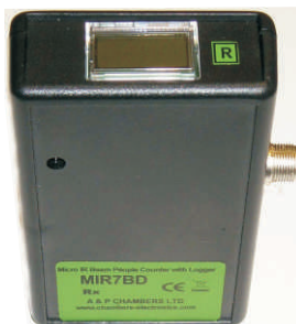
Receiver showing the data logger connector