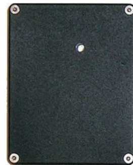
Metal Housing with tamperproof screws