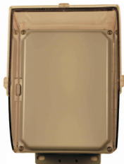
RRX-EB in protective housing