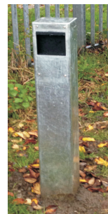
RRX-EB in metal post