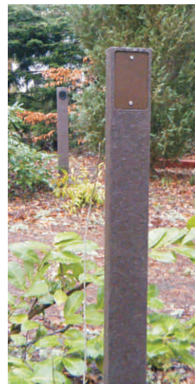
RBX-EB in recycled plastic post