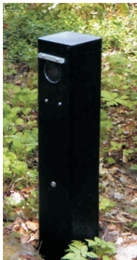
RBXL-EB in black metal post