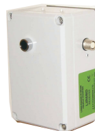
Receiver (can be supplied with internal logger or wireless transmitter)